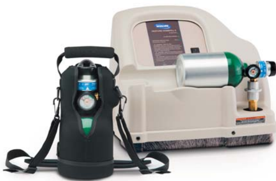
The HomeFill™ compressor is lightweight, weighing only 33 pounds.